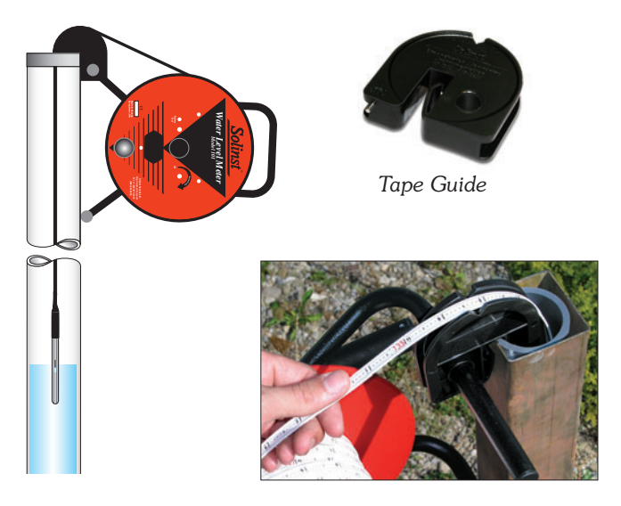
Consistent readings with different operators