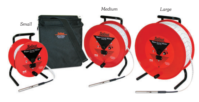
Model 101 Water Level Meter Family